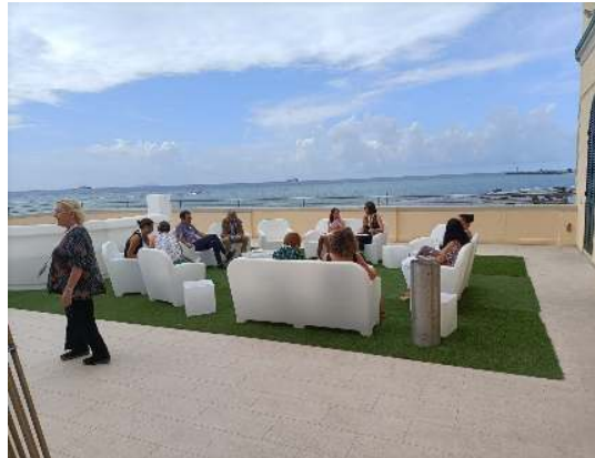
Multiplier Event for Remote Theatre in Italy