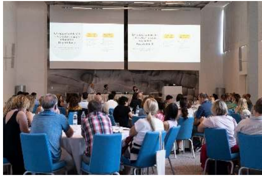
Multiplier Event for the Remote Theatre Project in Croatia