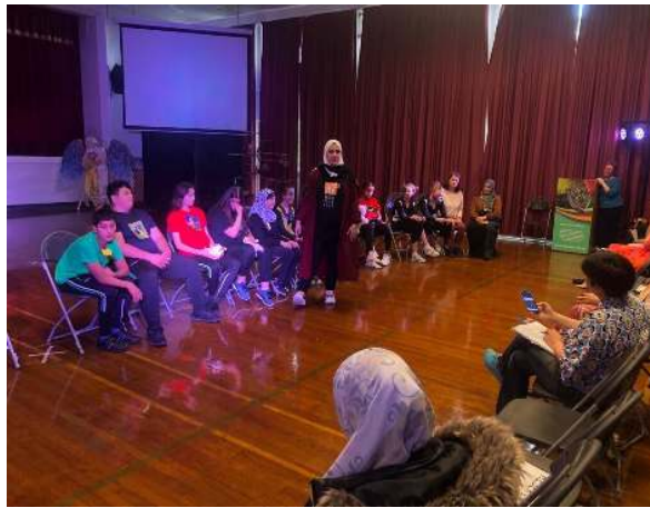
Multiplier Event for the Remote Theatre Project in the UK

For information about the rest of our team or any news related to the Remote Theatre project visit us on https://www.remotetheatre.org/ or follow our Facebook page @remotetheatre